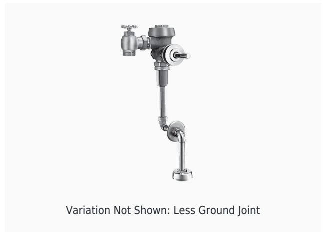
Variation Not Shown: Less Ground Joint